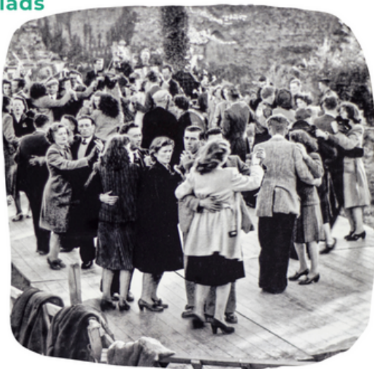
May Sunday Dancing at Greenpark 1948

You'll find the Marquee next to the playground in Glenbower Wood